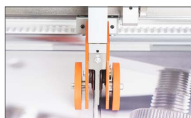
Single lengthwise rotary crush cutter (twin cutters optional)