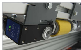
Advanced cutting mark reader