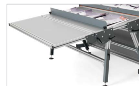
Adjustable collecting table (optional)