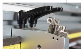
Fine pressure adjustment (according to the types of material)