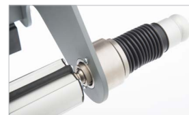
Unwinding shaft brake for adjusting the tension of the material