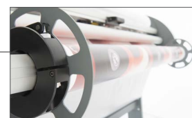
Aluminium 3" shaft with flanges for the right alignment of the roll