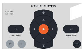
New software design for better usability